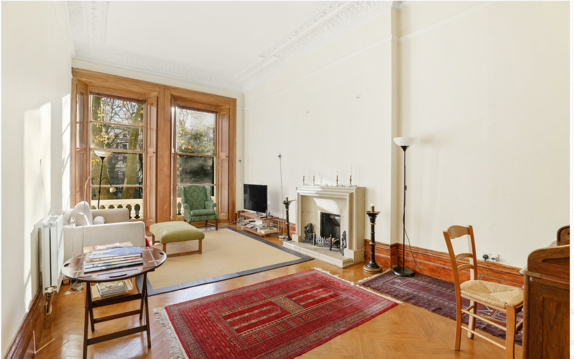
Cornwall Gardens, South Kensington, SW7 4AL

Guide Price £1,850,000 Share of Freehold