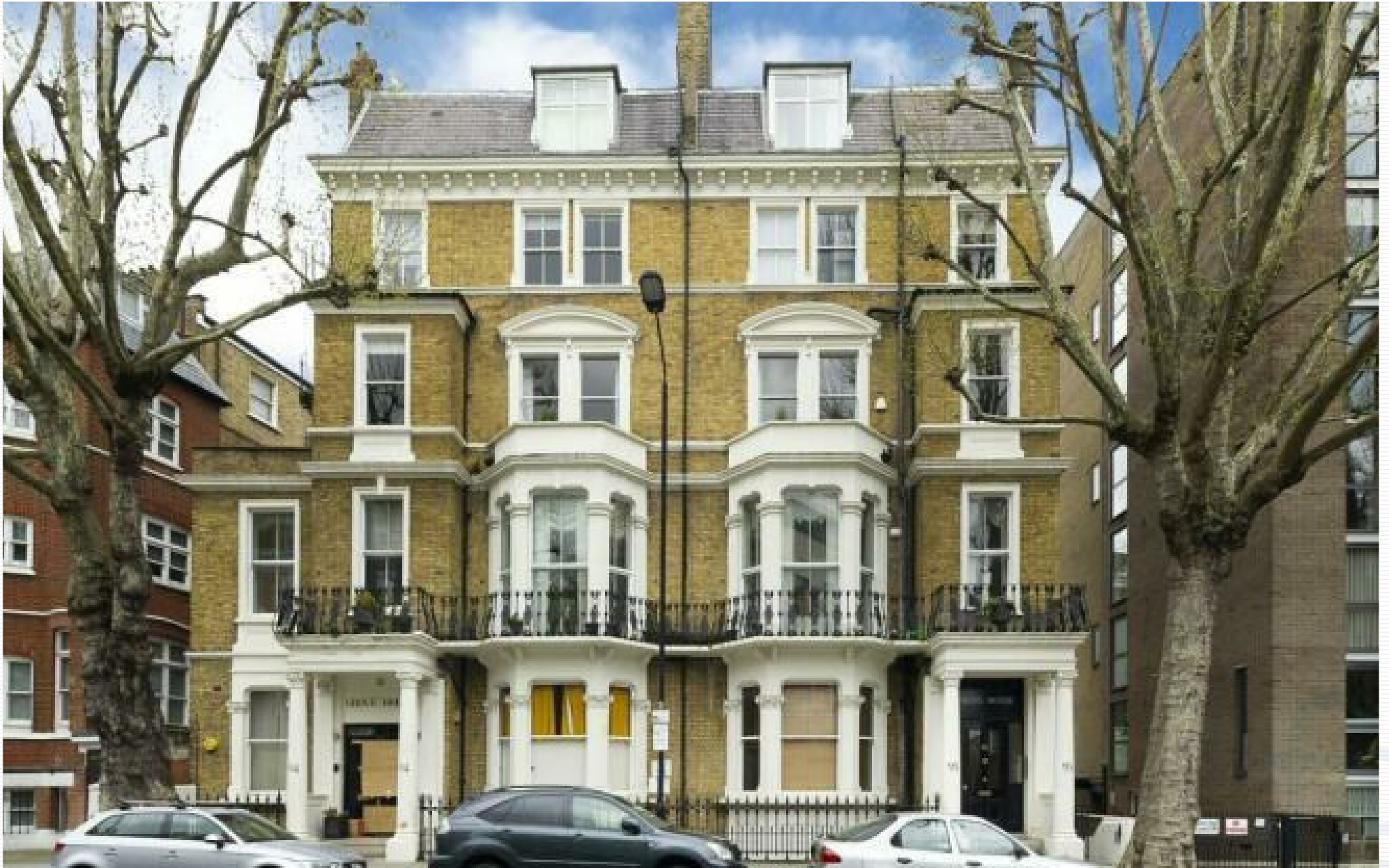
Addison Road, Holland Park, W14 8DD