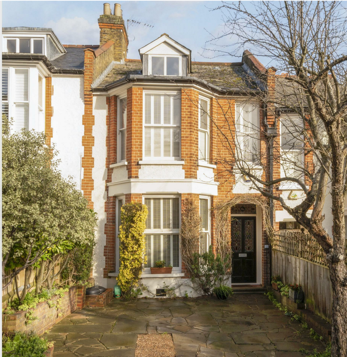
Spencer Hill, Wimbledon, SW19 4NY