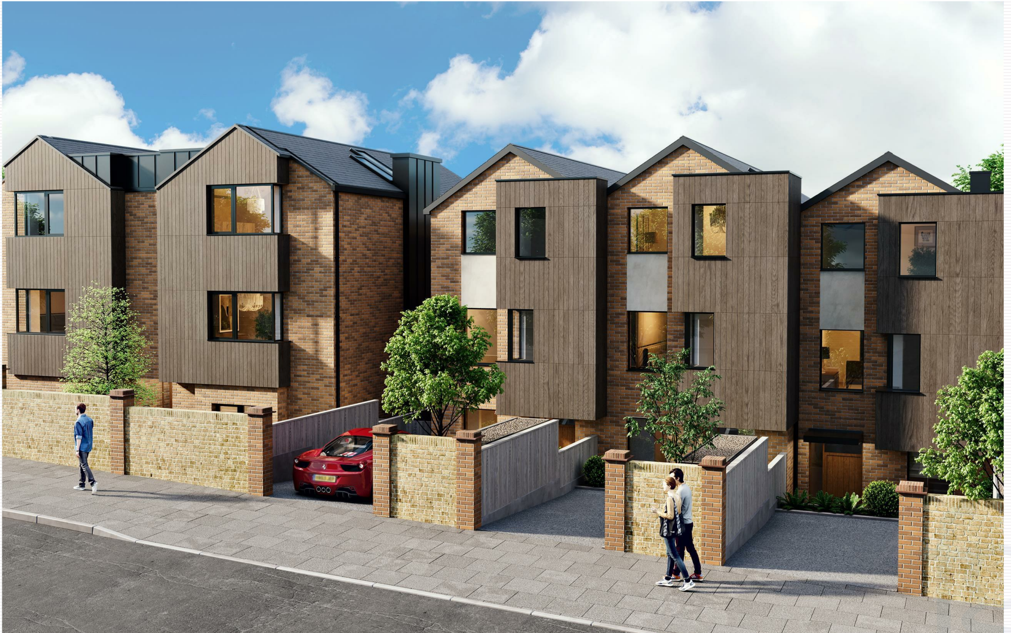
Cottenham Park Road, Wimbledon, SW20 0SB