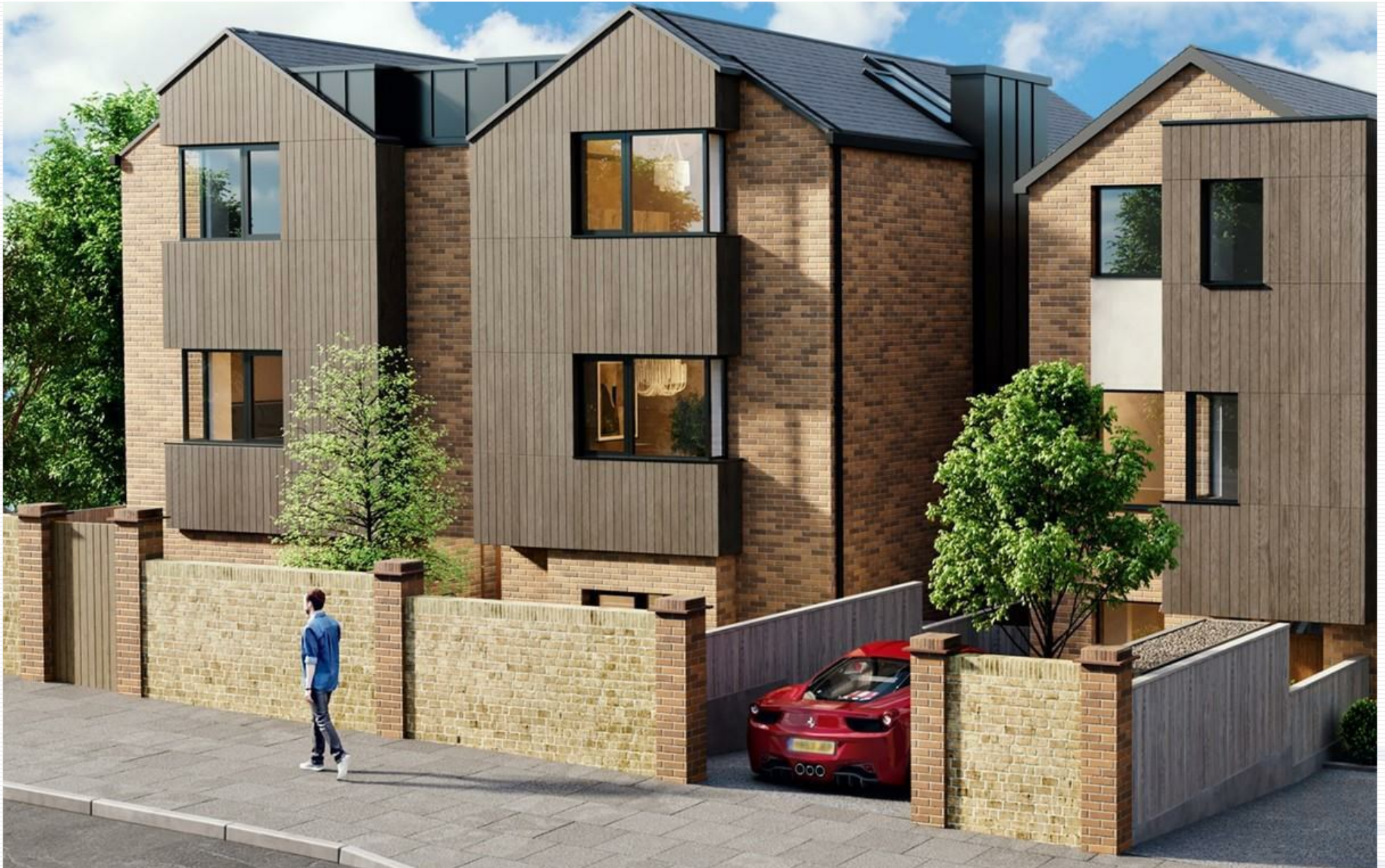
Cottenham Park Road, Wimbledon, SW20 0SB