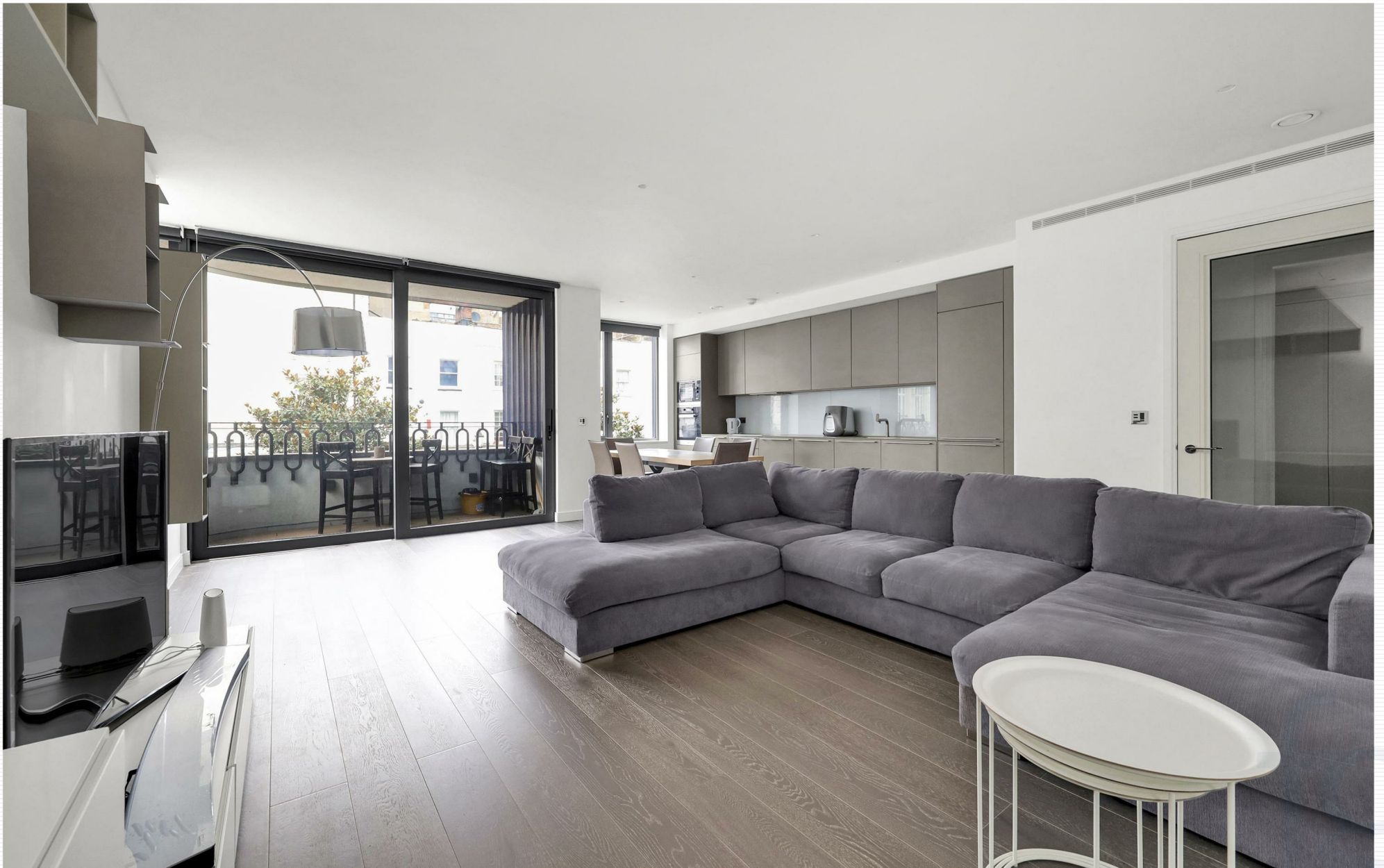
Queensway, Bayswater, W2 5HX