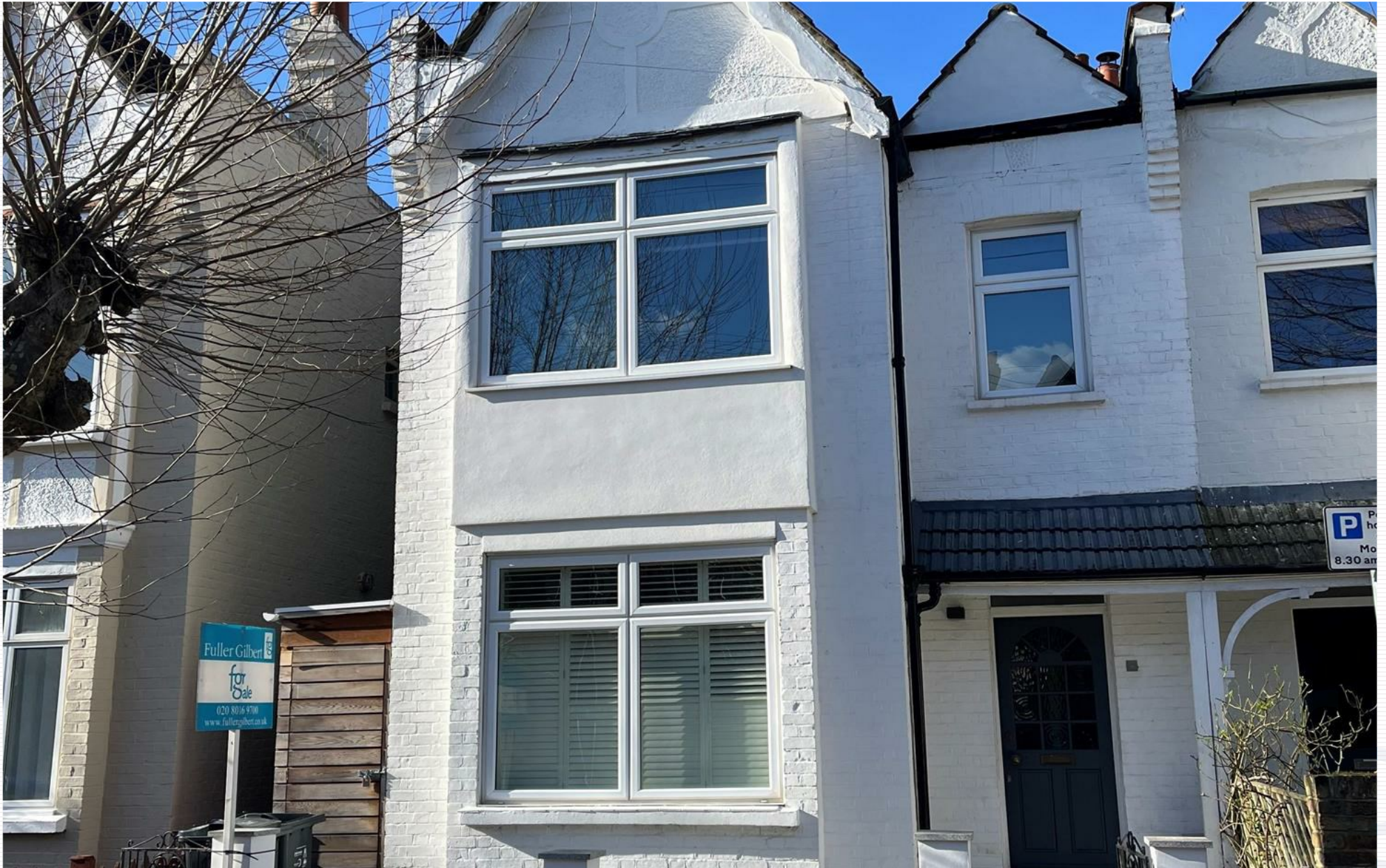
Southdown Road, Wimbledon, SW20 8PT